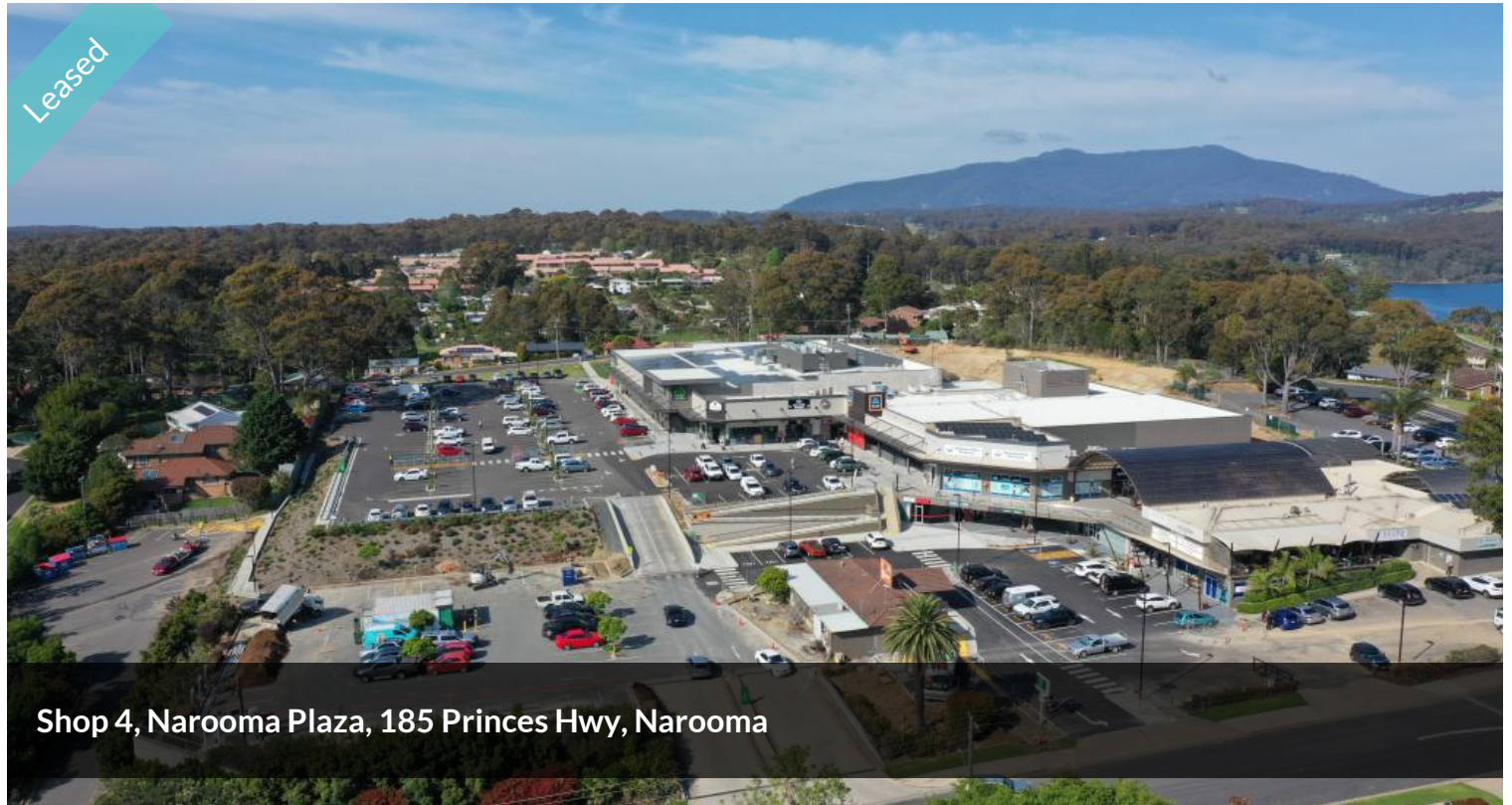
Shop 4, Narooma Plaza, 185 Princes Hwy, Narooma